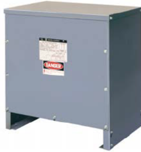
Style E—IP55 Rated

These dimensions are not for construction. Contact your local Schneider Electric representative for certified prints.