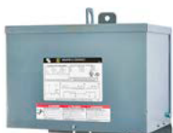
Style C—Type 3R Rated