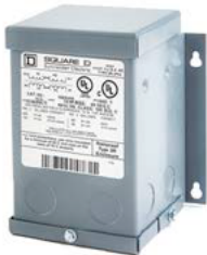
Style A—Type 3R Rated