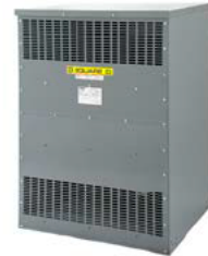
Style J—Type 2 Rated Converts to Type 3R with Weathershield