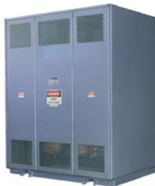
Style F—NEMA 1 Rated