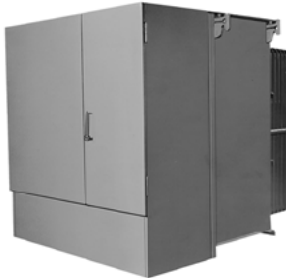
Liquid Filled Pad Mounted