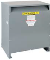
Style D and H—Type 2 Rated Converts to Type 3R with Weathershield