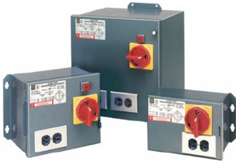
Transformer disconnects are available in NEMA Type 1 Standard, NEMA Type 12 Standard, and NEMA Type 1 Mini.