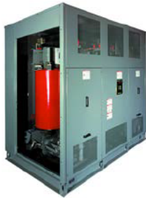
Power Cast II™

New! Revised Medium Voltage Transformer Energy Efficiency Information For 2016! In 2010 Schneider Electric released new efficiencies for MV transformers based on The Department of Energy (DOE) 10 CFR Part 431 Energy Conservation program for Commercial Equipment. We are now launching even more efficient transformers to further reduce energy consumption from MV transformers. Starting January 1, 2016 certain medium voltage distribution transformers with ratings of 2,500 kVA and below, 34.5 kV primary and below and 600 Vac class secondary voltages must meet revised minimum efficiency requirements. Liquid Filled Padmounts, Liquid Filled Substations, Dry Type VPI and Power Cast products shipped after January 1, 2016 will all be included. The minimum efficiency tables are listed below. Please contact your nearest Schneider Electric Sales Office for more information. Page 14-19 and 14-20 includes our updated offer.