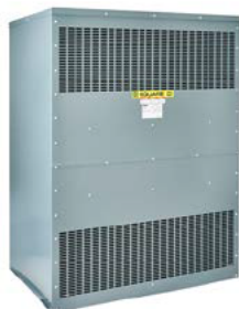
General Purpose Dry Type 600 Volts and Below