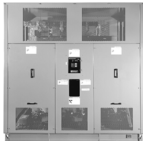
Power Dry II™