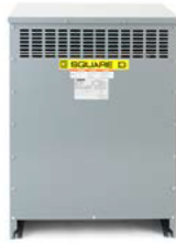
Style K—Type 2 Rated Converts to Type 3R with Weathershield