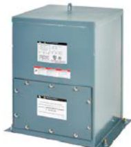
Style X—Type 4X Rated