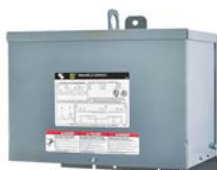
Type T and Type TF