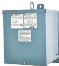
Style B—Type 3R Rated