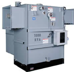
Liquid Filled Substation