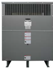
Style D, NEMA 1 Rated

Special outdoor construction required for NEMA 3R applications. Contact your local Schneider Electric sales office for details.